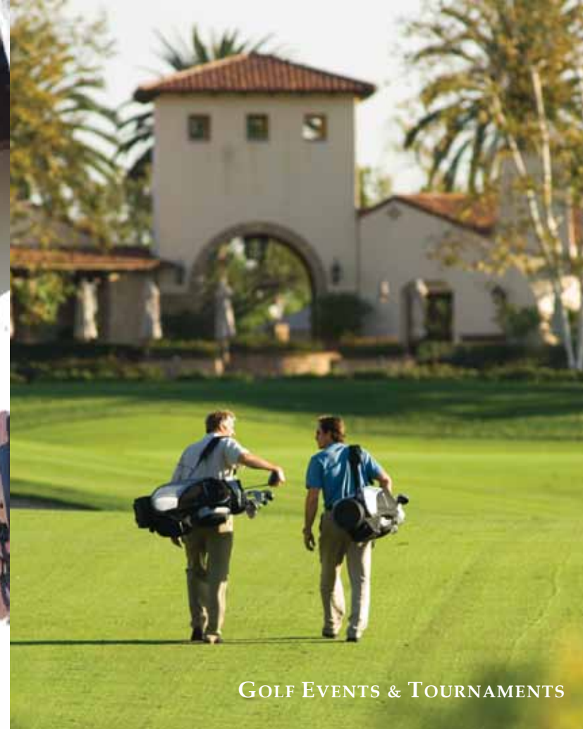
GOLF EVENTS & TOURNAMENTS